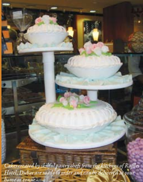
Cakes created by skilful pastry chefs from the kitchens of Raffles Hotel, Dubai are made to order and can be delivered at your home or venue