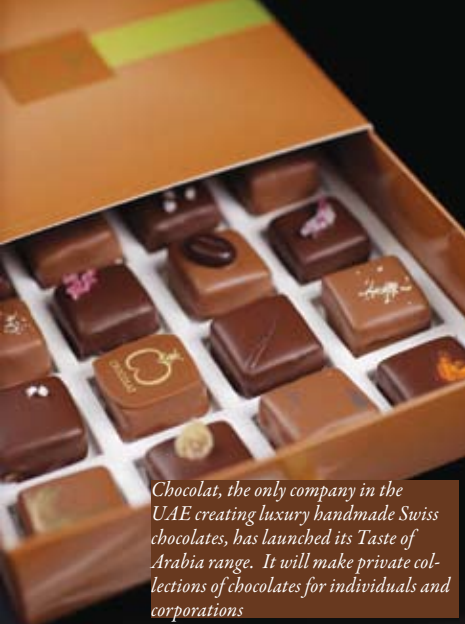
Chocolat, the only company in the UAE creating luxury handmade Swiss chocolates, has launched its Taste of Arabia range. It will make private collections of chocolates for individuals and corporations